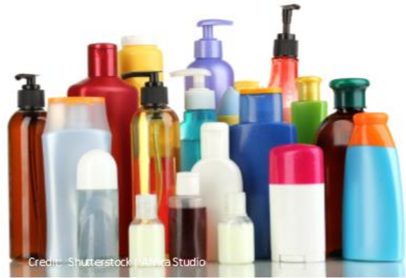
Endocrine disrupting chemicals can be found in everyday products such as soaps and shampoos

There is growing scientific evidence that routine exposures to substances known as endocrine disrupting chemicals (EDCs) can lead to cell changes that may increase the risk of developing breast cancer 43 . EDCs are chemicals that interfere with the normal hormonal regimes within the body. Some EDCs mimic and enhance the effects of the body's normal oestrogen production. Others interfere with the natural binding of hormones to cell receptors, and others may cause epigenetic changes which switch genes on or off within certain cells 44 . In a healthy body there is a finely regulated control of hormonal levels and actions. EDCs present in the external environment can interfere with this balance, in potentially harmful ways. Likely sources of EDCs are presented in the following section.